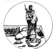
St. Joseph Table