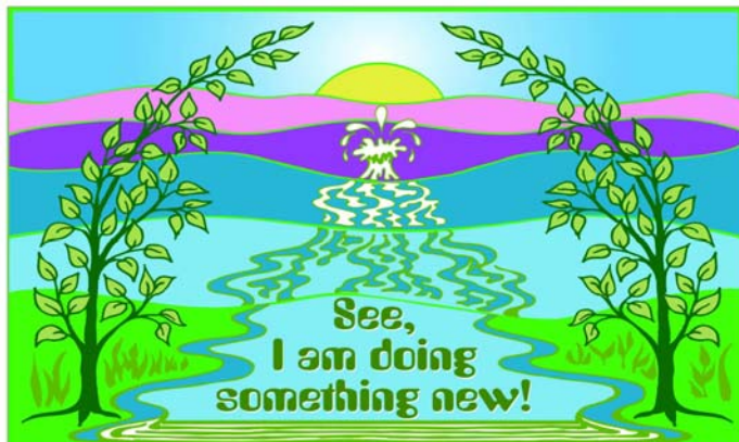
© 2006 J. S. Paluch Company, Inc.

Theme: Jesus' love and forgiveness offer true freedom.